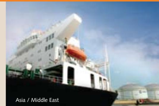
Asia / Middle East